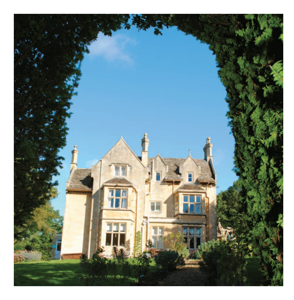
The countryside and rural pursuits are all near at hand. A trout stream runs through the grounds. Wildlife abounds and birdwatching is a particular pleasure at all times of year.

The spirit of Bybrook House is embodied in the relaxed, unhurried and friendly manner of the staff, the warmth of the building and the wonderful rural location.